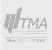
Artem Skorostensky Goodwin Procter LLP