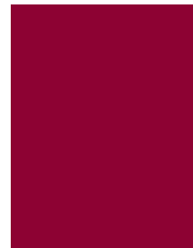
Full Page Bleed